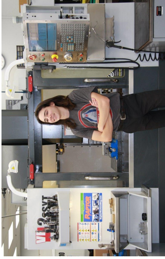
GCC Student Worker alongside a CNC Machine